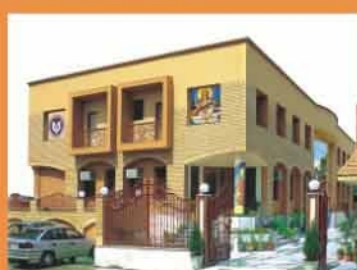
School Building, Anand Vihar