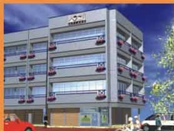
National Arcade, Gazipur