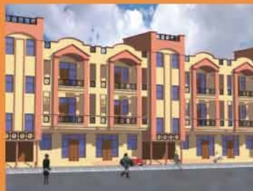
'e' - Residency, Kaushambi