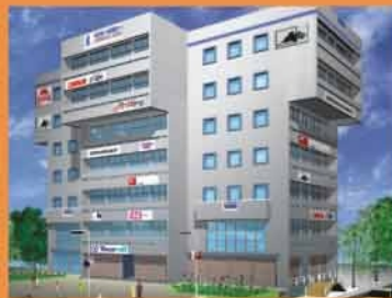
Rishabh Corporate Tower, Karkardooma